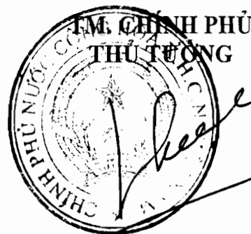
Nguyễn Xuân Phúc